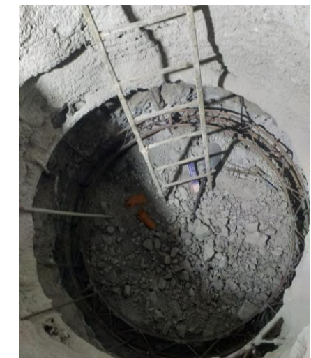
6. Preparation for excavation of ventilation shaft at surge tunnel