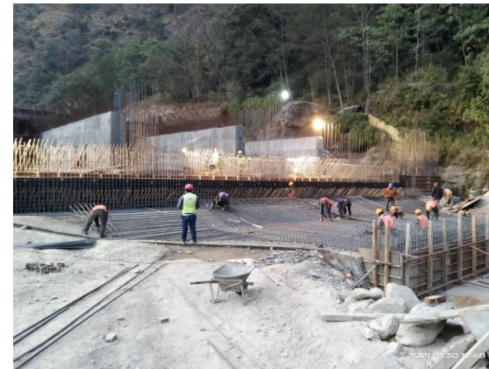
2. Settling basin and headpond work