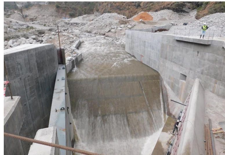
1. River Diversion