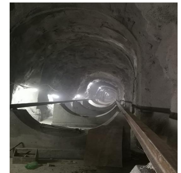
8. Rail track installation at penstock tunnel 1 for penstock pipe installation.

Note: The Reporting period is till January end 2021. The latest site photos are updated on timely basis in the Gallery section of our website.