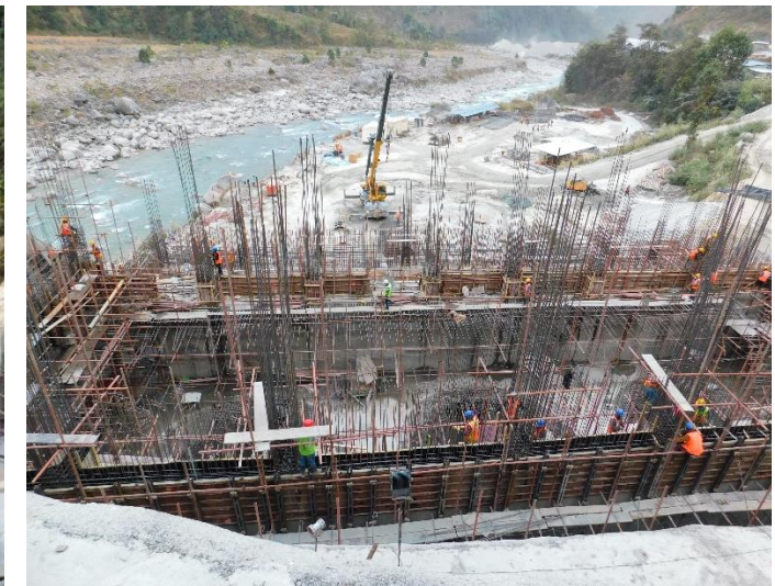
3. Powerhouse progress.