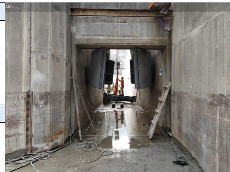
7. Radial gate installation at bedload sluice