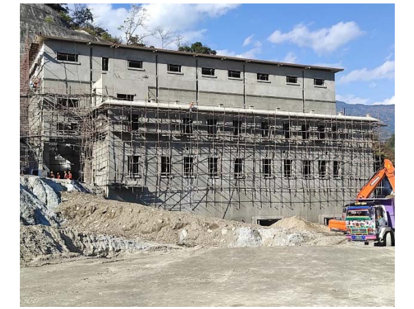
Figure 3. Powerhouse