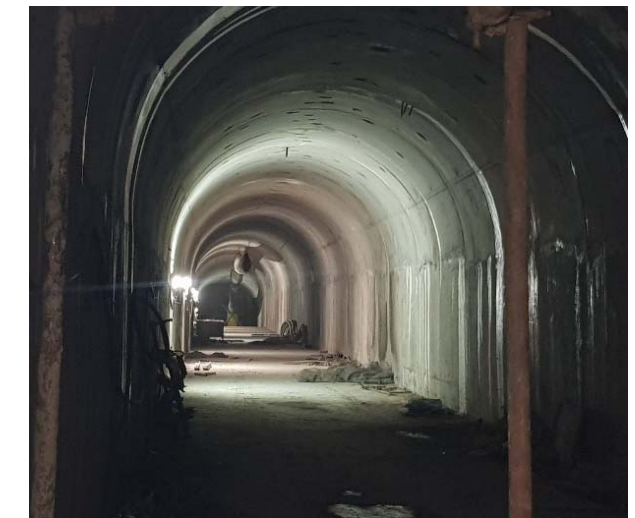
6. Lining work at surge tunnel