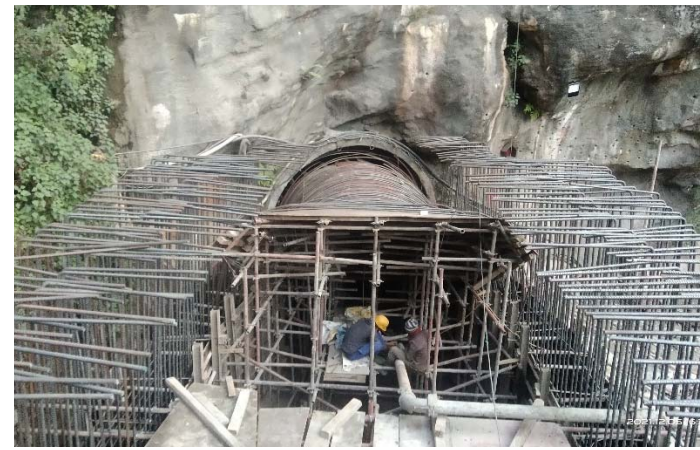
2. Headrace culvert at headrace tunnel inlet junction