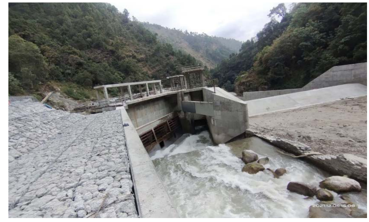
1. Headworks area