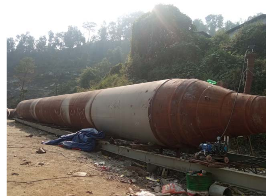
7. Penstock pipe pressure test at site