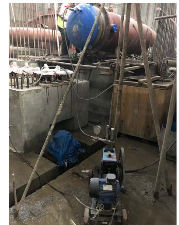
8. Hydrostatic test of distributor pipe

Note: The Reporting period is till November end 2021. The latest site photos are updated on timely basis in the Gallery section of our website.