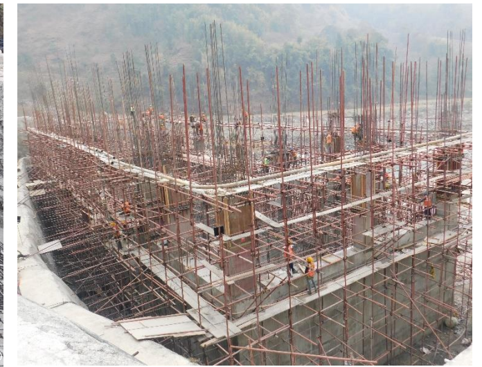
3. Powerhouse concrete works on progress.