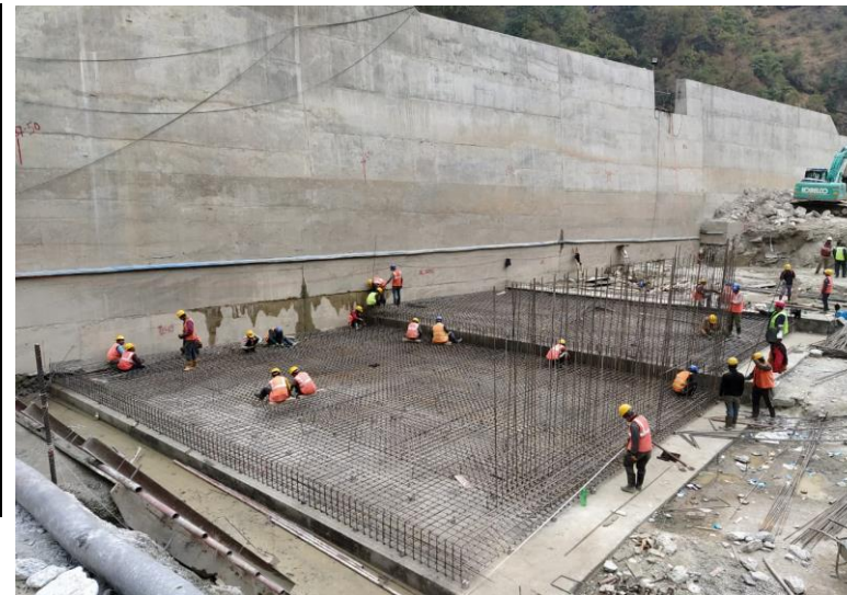
1. Stilling basin progress after 2 nd stage river diversion