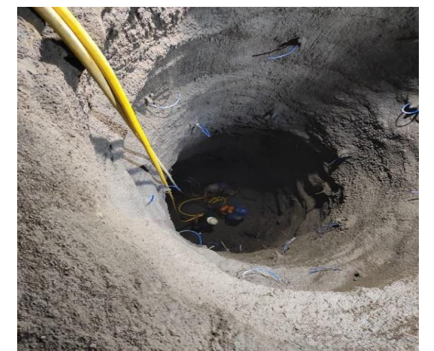
6. Ventilation shaft for surge tunnel