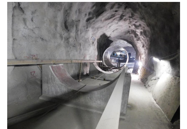
8. Penstock pipe installation at site

Note: The Reporting period is till February end 2021. The latest site photos are updated on timely basis in the Gallery section of our website.