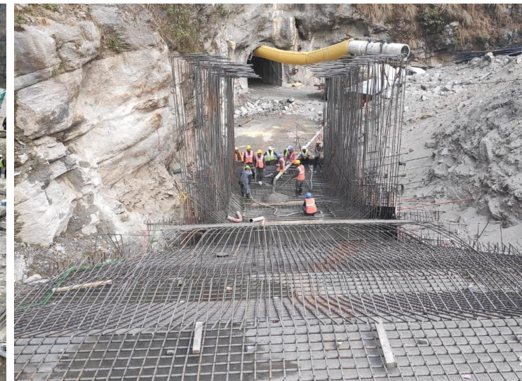
2. Headrace culvert concreting work