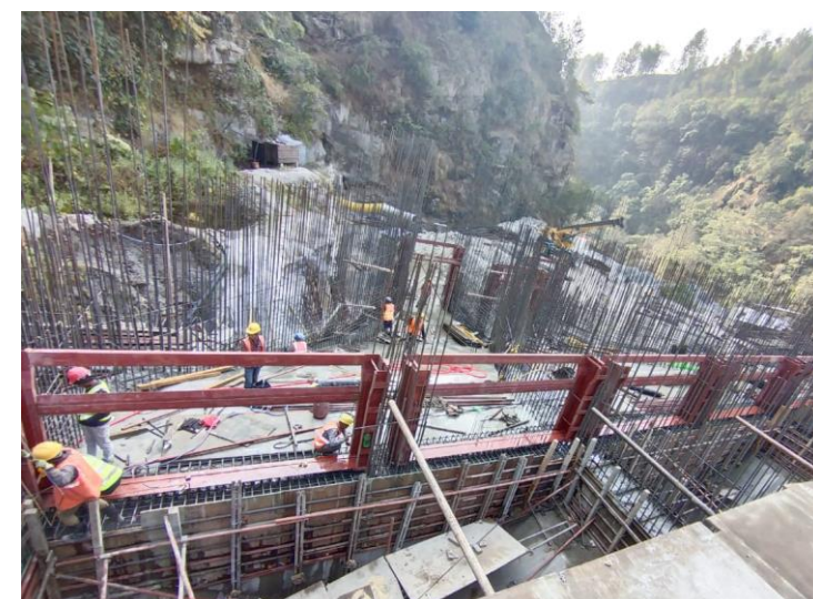
7. Slotted gate embedded part installation at Settling Basin outlet.