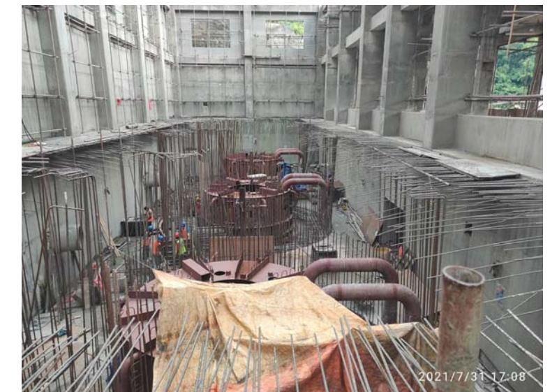
8. Turbine housing assembly and fitting work at Powerhouse

Note: The Reporting period is till July end 2021. The latest site photos are updated on timely basis in the Gallery section of our website.