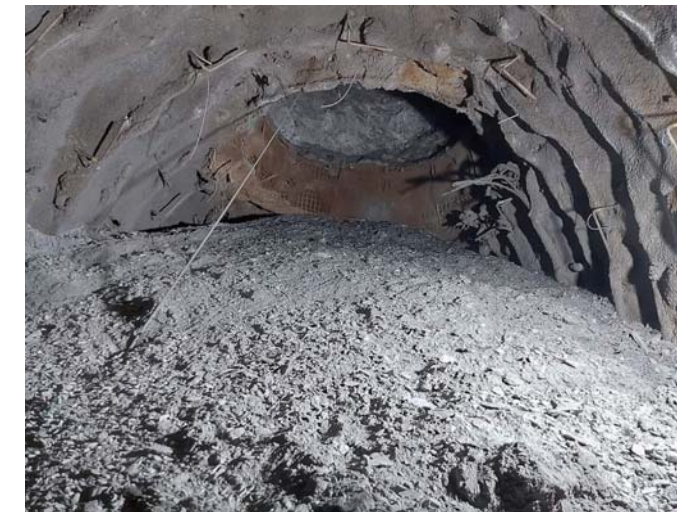
6. Vertical Shaft 1 breakthrough