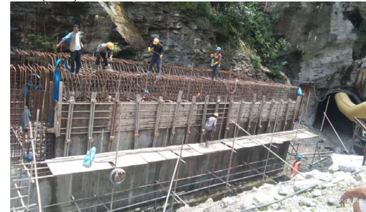
2. Headrace Culvert progress.