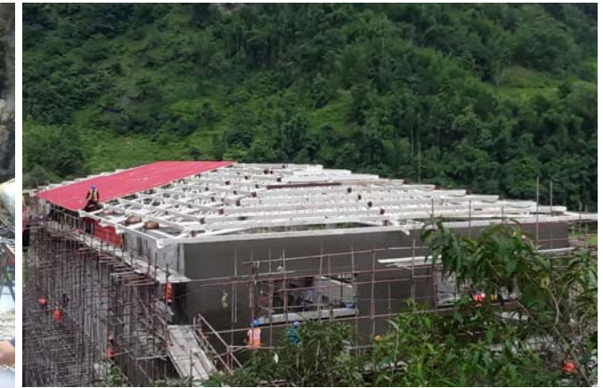
3. Roofing work at Powerhouse