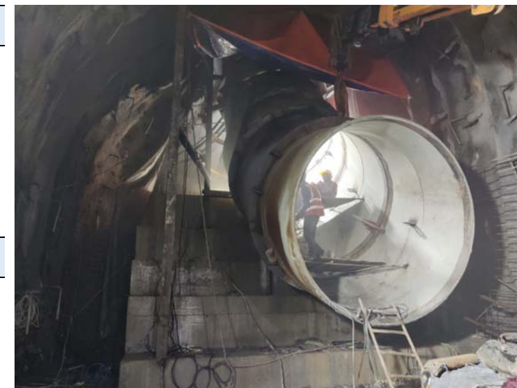
7. Bend installation at vertical shaft 2 bottom