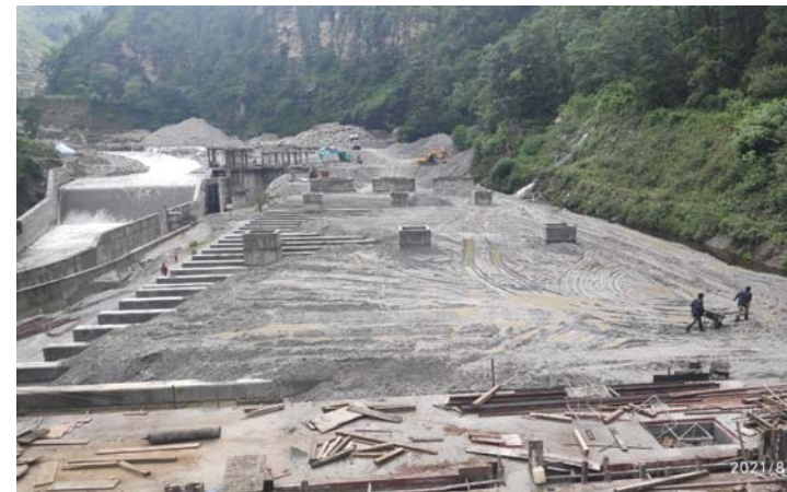
1. Headworks area.