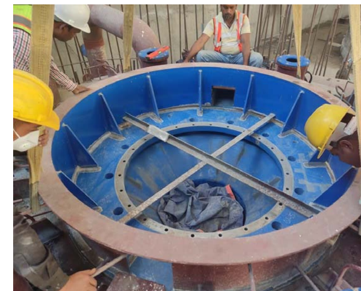
7. Installation of pit liner at unit 3

Note: The Reporting period is till September end 2021. The latest site photos are updated on timely basis in the Gallery section of our website.