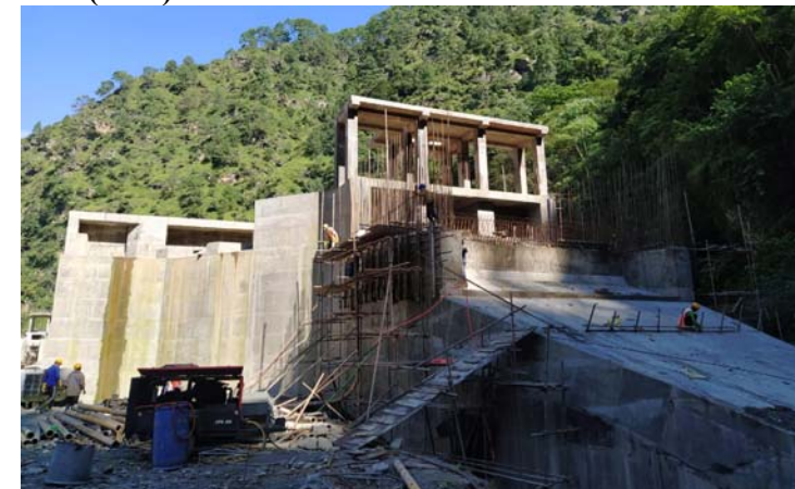
2. Headpond progress.