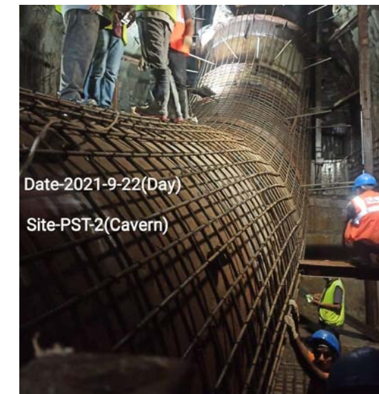
5. Rebar work at bend area