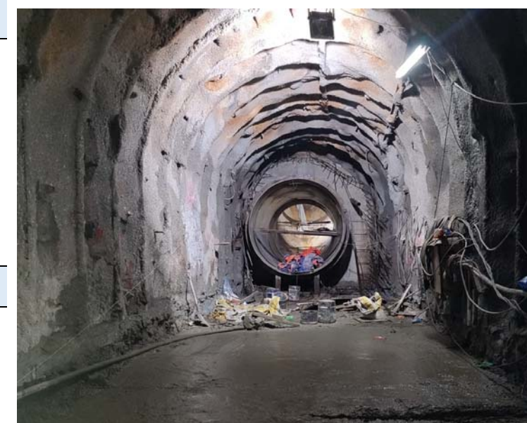
6. Penstock pipe at PST 2