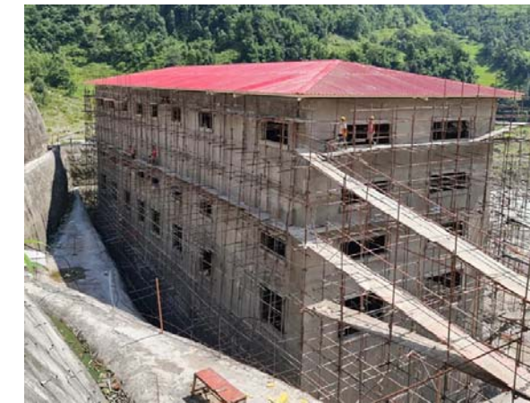
3. Progress at Powerhouse