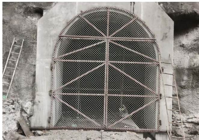
Figure 4. Portal work at adit tunnel 1