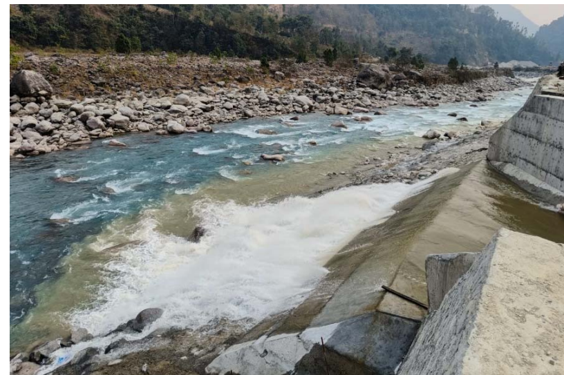
Figure 7. Water from Solu Khola dropped to Dudh Koshi river through Tailrace