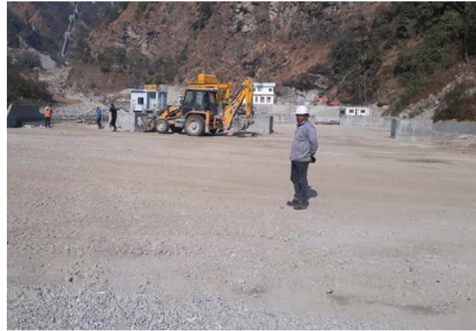
Figure 1. Settling basin area