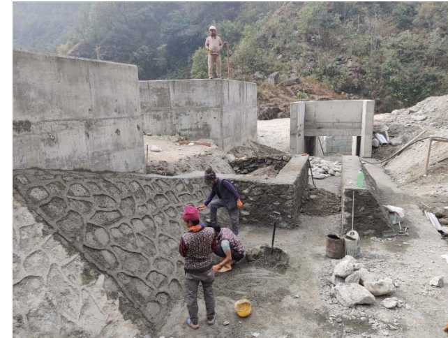
Figure 2. Kholsi protection work at headworks