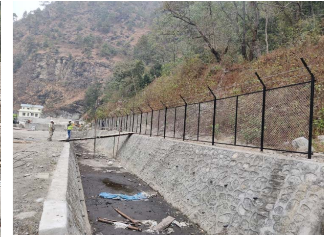
Figure 3. Fencing work