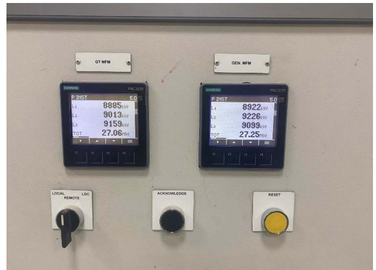
Figure 8. Energy generated displayed in control panel

Note: The Reporting period is till February end 2023. The latest site photos are updated on timely basis in the Gallery section of our website.