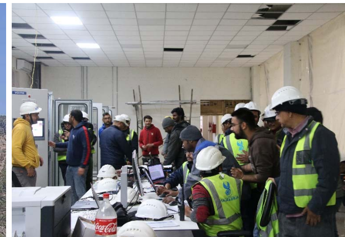
Figure 6. Commissioning started